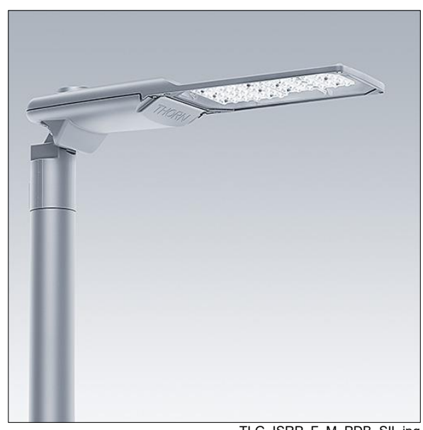
TLG ISRP F M PDB SIL.jpg