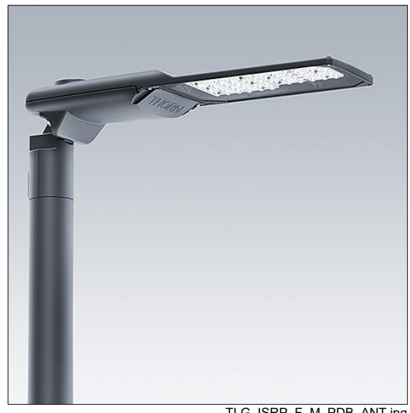
TLG ISRP F M PDB ANT.jpg