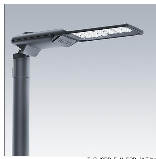
TLG ISRP F M PDB ANT.jpg