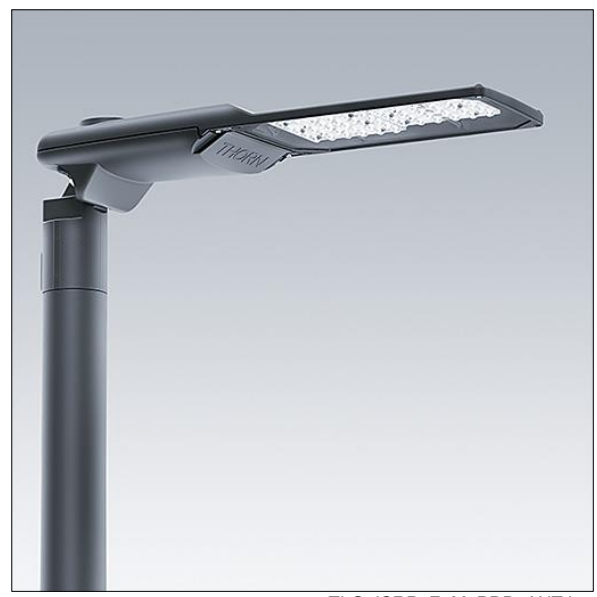
TLG ISRP F M PDB ANT.jpg