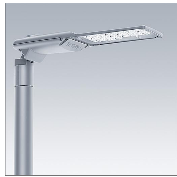
TLG ISRP F M PDB SIL.jpg