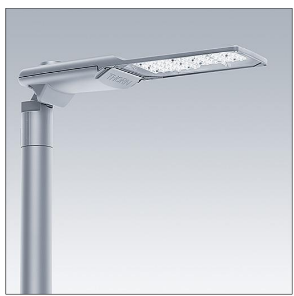
TLG ISRP F M PDB SIL.jpg