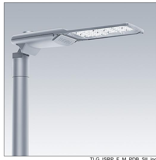
TLG ISRP F M PDB SIL.jpg