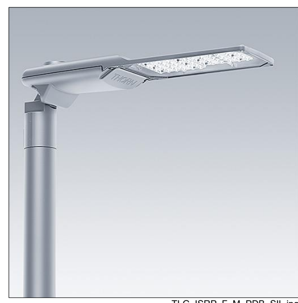
TLG ISRP F M PDB SIL.jpg