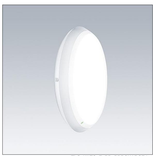
TLG KATO F RD PDBCHARGE.jpg

This product contains a light source of energy efficiency class C.