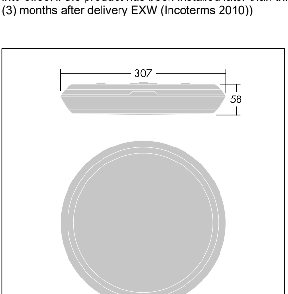
TLG KATO M RD LDS.wmf

Self-contained emergency luminaires rely on long-lasting batteries. This product's high-tech lithium iron phosphate battery is robust and comes with a three-year guarantee (applicable subject to the terms and conditions of and to the extent as set forth in the manufacturer's guarantee on Thorn products, which shall be applicable analogously and which is available under http://www.thornlighting.com/en/products/5-year-guarantee/5-year-warranty/terms-of-guarantee_en.pdf. The battery guarantee shall not come into effect if the product has been installed later than three (3) months after delivery EXW (Incoterms 2010))