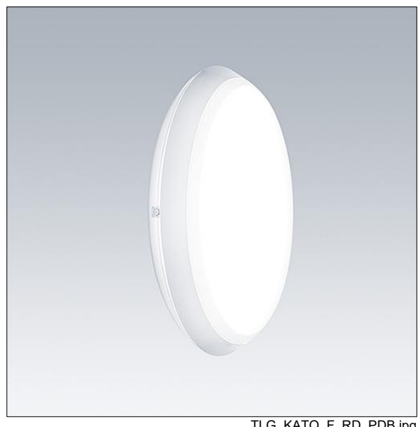
TLG KATO F RD PDB.jpg

Self-contained emergency luminaires rely on long-lasting batteries. This product's high-tech lithium iron phosphate battery is robust and comes with a three-year guarantee (applicable subject to the terms and conditions of and to the extent as set forth in the manufacturer's guarantee on Thorn products, which shall be applicable analogously and which is available under http://www.thornlighting. com/en/products/5-year-guarantee/5-year-warranty/termsof-guarantee en.pdf. The battery guarantee shall not come into effect if the product has been installed later than three (3) months after delivery EXW (Incoterms 2010))