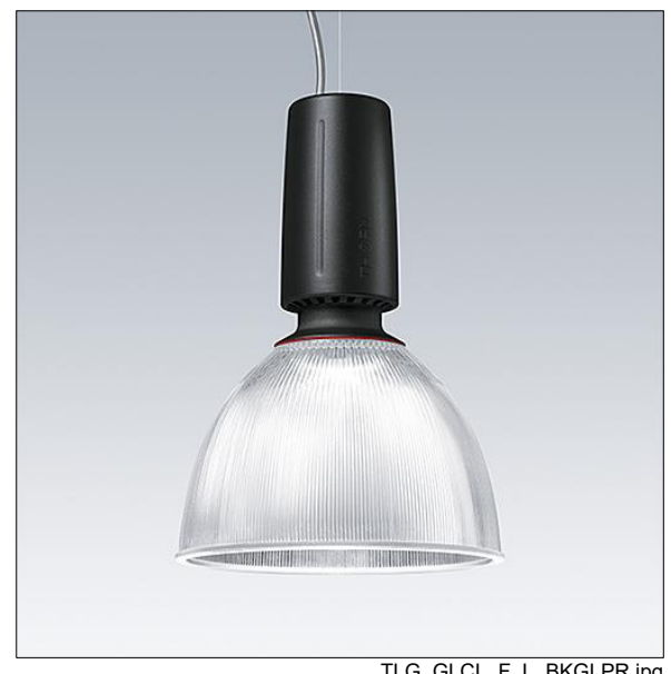
TLG GLCL F L BKGLPR.jpg