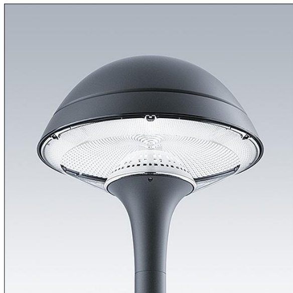
TLG PLRL F IRC ANT.jpg

Dimensions: Ø564 x 555 mm Luminaire input power: 36 W Luminaire luminous flux: 3932 lm Luminaire efficacy: 109 lm/W Weight: 9.5 kg Scx: 0.191 m 2