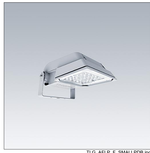
TLG AFLP F SMALLPDB.jpg