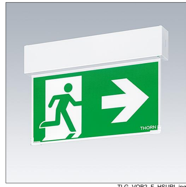
TLG VOB2 F HSURL.jpg