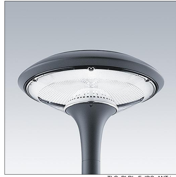
TLG PLRL F IDC ANT.jpg