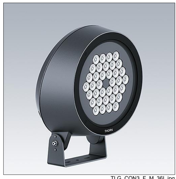
TLG CON3 F M 36L.jpg