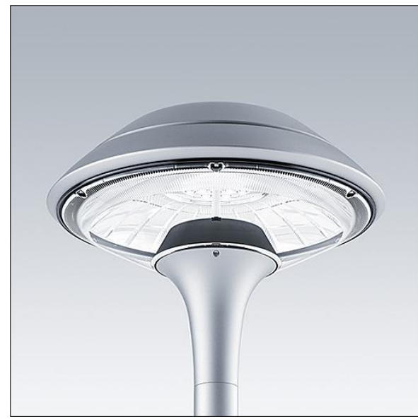
TLG PLRL F DFC GY.jpg