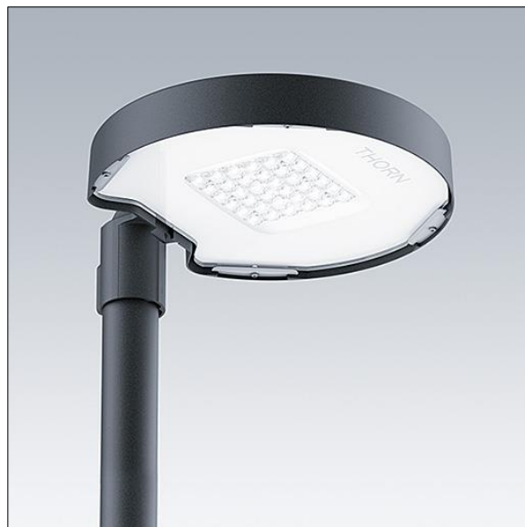
TLG CARA F S PostTop.jpg

Dimensions: Ø435 x 81 mm Luminaire input power: 79 W Luminaire luminous flux: 9817 lm Luminaire efficacy: 124 lm/W Weight: 7 kg Scx: 0.04 m²