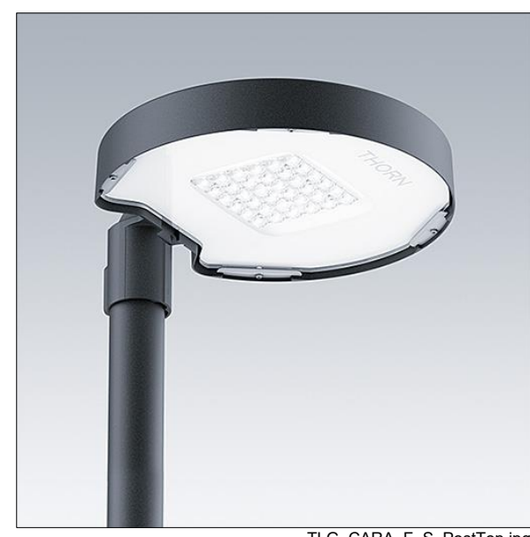
TLG CARA F S PostTop.jpg