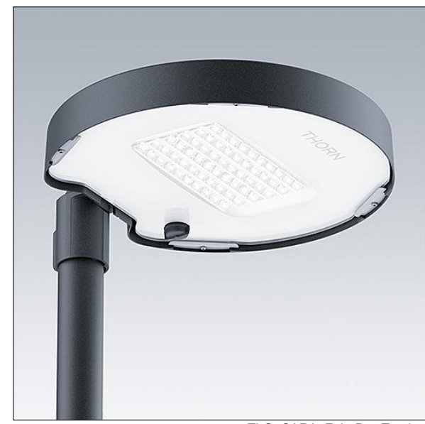
TLG CARA F L PostTop.jpg