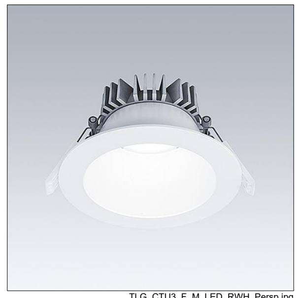
TLG CTU3 F M LED RWH Persp.jpg