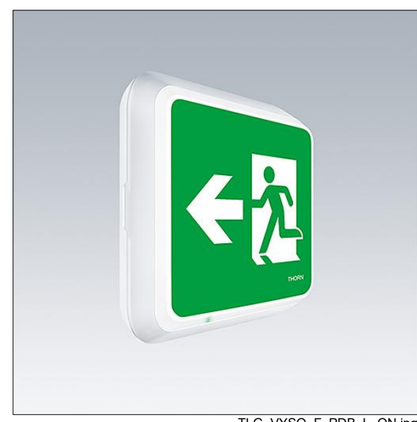
TLG VYSQ F PDB L ON.jpg

Thorn Lighting is constantly developing and improving its products. The right is reserved to change specifications without prior notification or public announcement. © Thorn Lighting