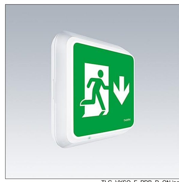
TLG VYSQ F PDB D ON.jpg

A slim, square, surface mounted, LED safety sign luminaire. Luminaire for central emergency light supply, for single luminaire monitoring via DALI (DALI-2 certified), settable emergency light level. NFC interface for addressing, configuration and maintenance via PROset Pen (article: 22170290) or PROset app, addressing also alternatively possible visually or via EZ-addressing. Power supply: 220-240 Vac (± 10%), 50/60 Hz; 176-280 Vdc. Body: injection moulded polycarbonate, white (RAL 9016). Diffuser: opal polycarbonate, with glued, printed emergency exit direction arrow (down) pictogram according to ISO 7010. Uniform backlighting of pictogram, luminance > 500 cd/m² in the white region and 200 cd / m² on average in mains mode (according to DIN 4844), 2 cd / m² minimum in emergency mode (according to EN 1838). Recognition distance according to EN 1838: 44m. Class II electrical, IP65, Impact strength: IK10. ambient temperature: -30°C to +35°C. Suitable for direct mounting to wall. Loop-in, loopout is possible for cables up to 2.5 mm<sup>2</sup>. BESA compatible. Food certificate (to be used in areas with fully packaged food). Luminaire wired with halogen free and silicone free leads. Luminaire with D symbol (for use in environments in which the accumulation of conductive dust on the luminaire can be expected).