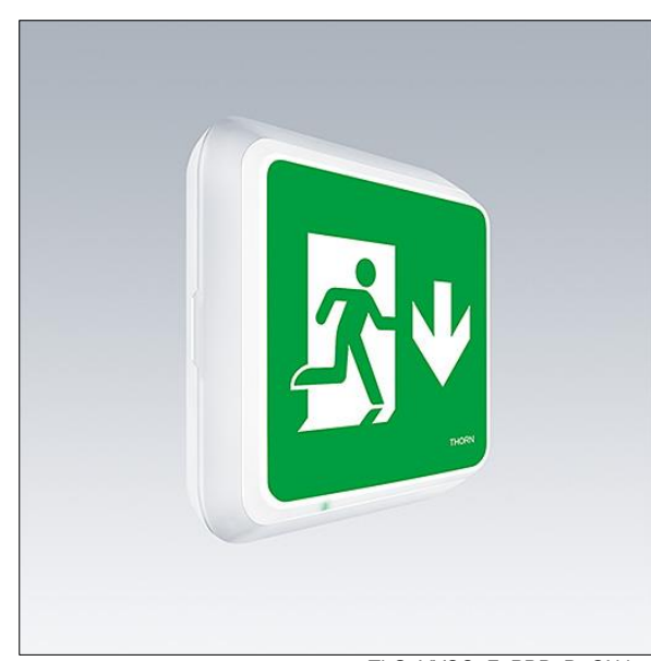
TLG VYSQ F PDB D ON.jpg

A slim, square, surface mounted, LED safety sign luminaire. Luminaire for central emergency light supply, for single monitoring of the luminaire via Powerline in connection with the eBox System, settable emergency light level. NFC interface for addressing, configuration and maintenance via PROset Pen (article: 22170290) or PROset app, addressing also alternatively possible visually or via EZ-addressing. Power supply: 220-240 Vac (± 10%), 50/60 Hz; 176-280 Vdc. Body: injection moulded polycarbonate, white (RAL 9016). Diffuser: opal polycarbonate, with glued, printed emergency exit direction arrow (down) pictogram according to ISO 7010. Uniform backlighting of pictogram, luminance > 500 cd/m<sup>2</sup> in the white region and 200 cd / m<sup>2</sup> on average in mains mode (according to DIN 4844), 2 cd / m² minimum in emergency mode (according to EN 1838). Recognition distance according to EN 1838: 44m. Class II electrical, IP65, Impact strength: IK10. ambient temperature: -30°C to +35°C. Suitable for direct mounting to wall. Loop-in, loop-out is possible for cables up to 2.5 mm<sup>2</sup>. BESA compatible. Food certificate (to be used in areas with fully packaged food). Luminaire wired with halogen free and silicone free leads. Luminaire with D symbol (for use in environments in which the accumulation of conductive dust on the luminaire can be expected).