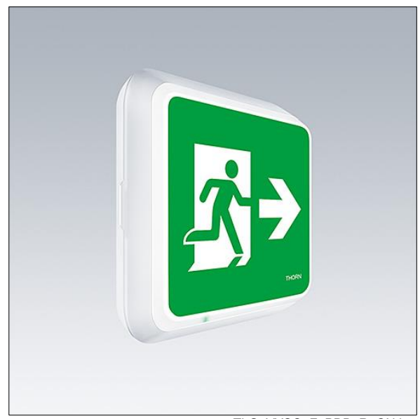
TLG VYSQ F PDB R ON.jpg

A slim, square, surface mounted, LED safety sign luminaire. Luminaire for central emergency light supply, with circuit monitoring, without single monitoring of the luminaire. NFC interface for maintenance via PROset Pen (article: 22170290) or PROset app. Power supply: 220-240 Vac (± 10%), 50/60 Hz; 176-280 Vdc. Body: injection moulded polycarbonate, white (RAL 9016). Diffuser: opal polycarbonate, with glued, printed emergency exit direction arrow (right) pictogram according to ISO 7010. Uniform backlighting of pictogram, luminance > 500 cd/m² in the white region and 200 cd / m2 on average in mains mode (according to DIN 4844), 2 cd / m² minimum in emergency mode (according to EN 1838). Recognition distance according to EN 1838: 44m. Class II electrical, IP65, Impact strength: IK10. ambient temperature: -30°C to +35°C. Suitable for direct mounting to wall. Loop-in, loop-out is possible for cables up to 2.5 mm<sup>2</sup>. BESA compatible. Food certificate (to be used in areas with fully packaged food). Luminaire wired with halogen free and silicone free leads. Luminaire with D symbol (for use in environments in which the accumulation of conductive dust on the luminaire can be expected).