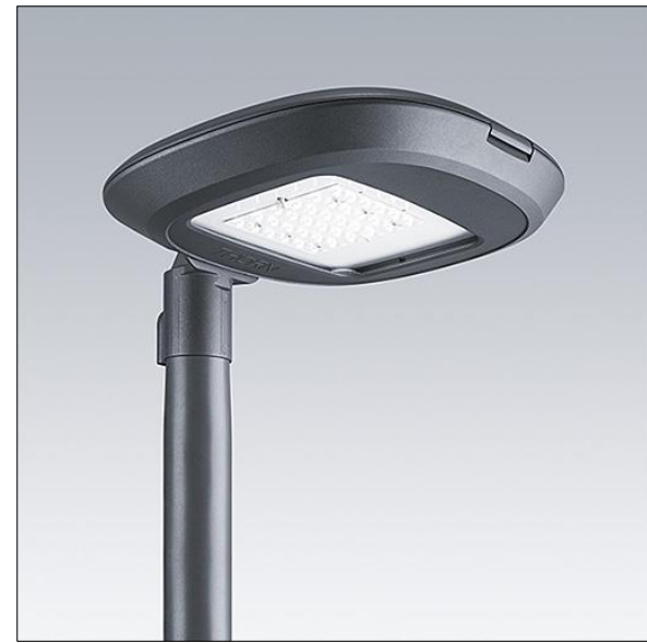
TLG FLOW F MTP CL.jpg

Weight: 11.1 kg Scx: 0.054 m<sup>2</sup>