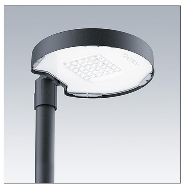
TLG CARA F S PostTop.jpg