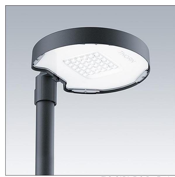
TLG CARA F S PostTop.jpg