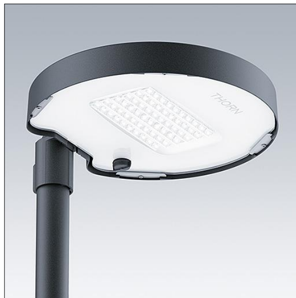
TLG CARA F L PostTop.jpg

Dimensions: Ø510 x 87 mm Luminaire input power: 118 W Luminaire luminous flux: 15593 lm Luminaire efficacy: 132 lm/W Weight: 9.7 kg Scx: 0.05 m 2