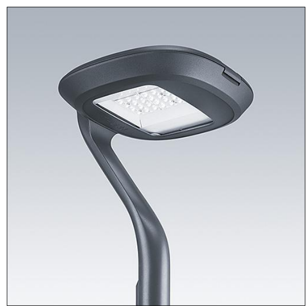
TLG FLOW F PDB CL.jpg

Weight: 14.64 kg Scx: 0.054 m<sup>2</sup>