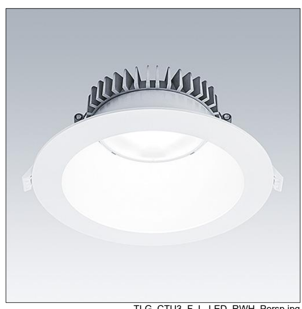
TLG CTU3 F L LED RWH Persp.jpg