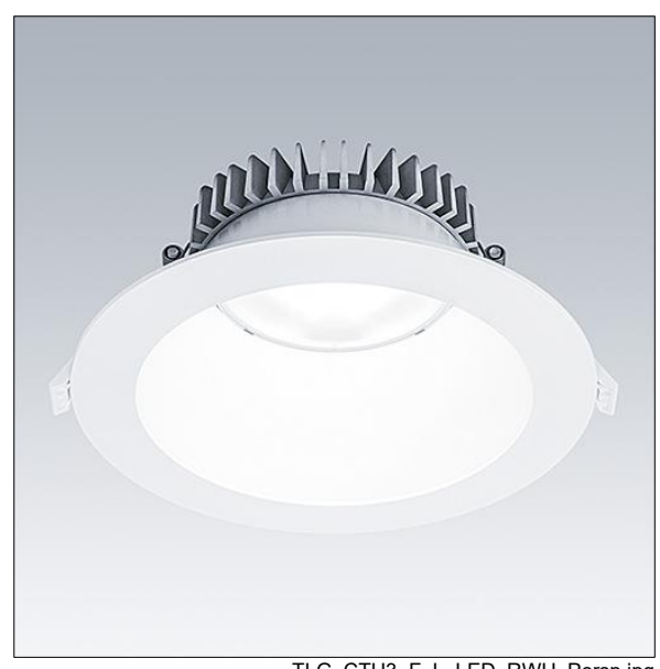
TLG CTU3 F L LED RWH Persp.jpg