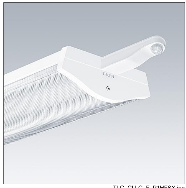
TLG CLLG F P1HFSX.jpg