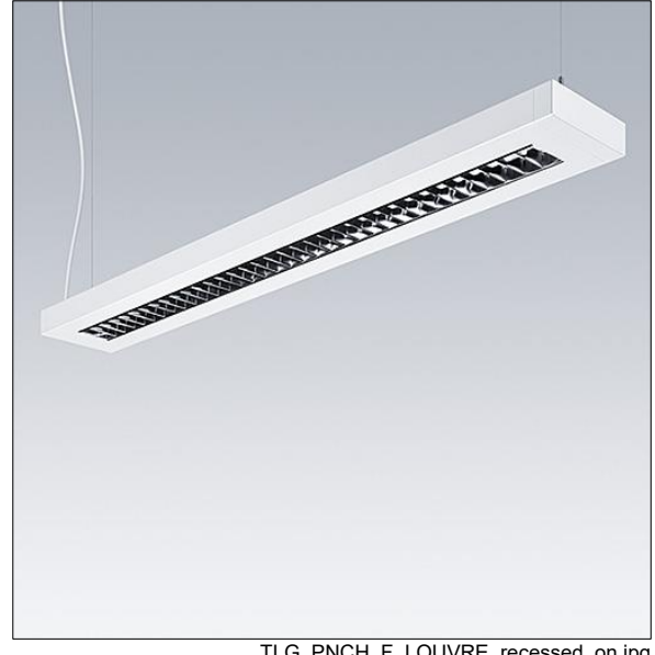
TLG PNCH F LOUVRE recessed on jpg