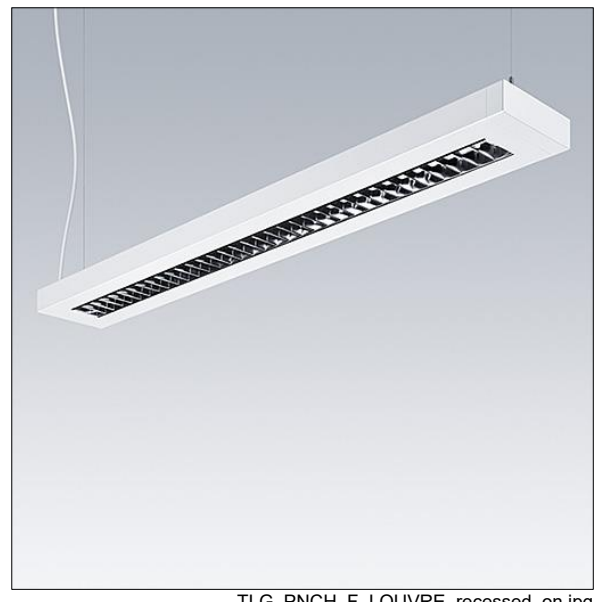
TLG PNCH F LOUVRE recessed on jpg