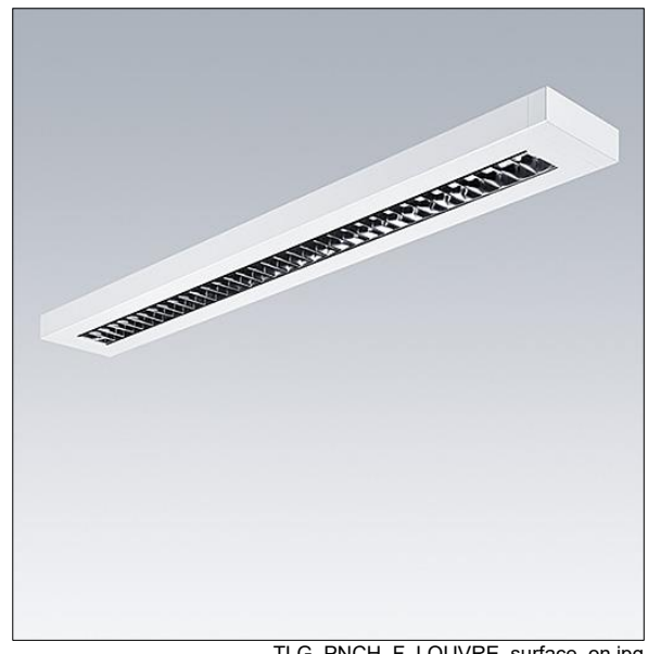
TLG PNCH F LOUVRE surface on jpg