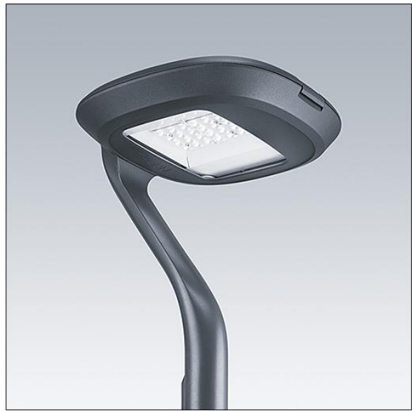
TLG FLOW F PDB CL.jpg

Weight: 12.61 kg Scx: 0.054 m<sup>2</sup>