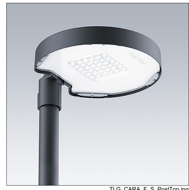
TLG CARA F S PostTop.jpg