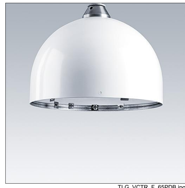
TLG VCTR F 65PDB.jpg

Weight: 4.93 kg Scx: 0.084 m<sup>2</sup>