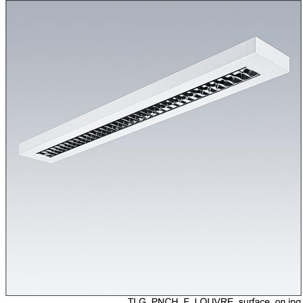
TLG PNCH F LOUVRE surface on jpg