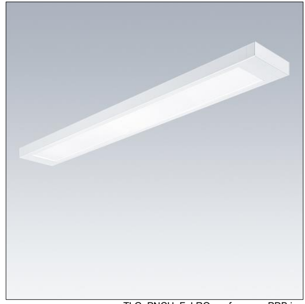
TLG PNCH F LRO surface on PDB.jpg