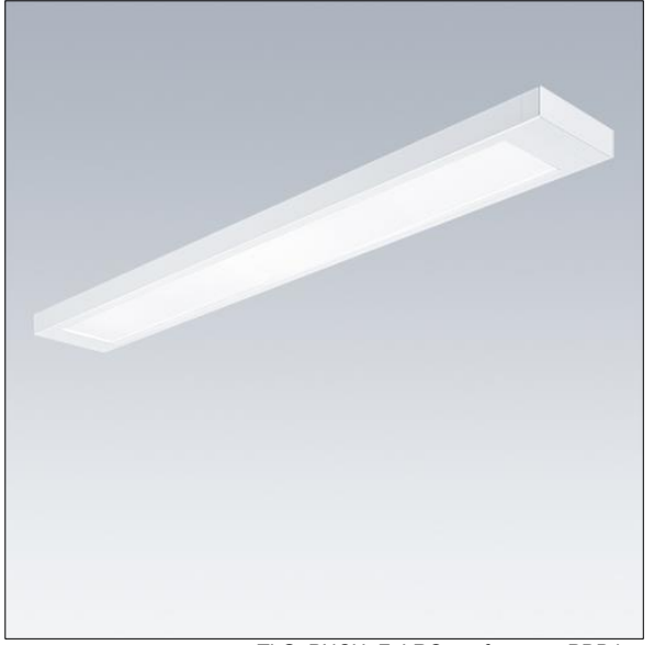
TLG PNCH F LRO surface on PDB.jpg