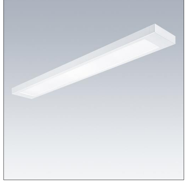
TLG PNCH F LRO surface on PDB.jpg