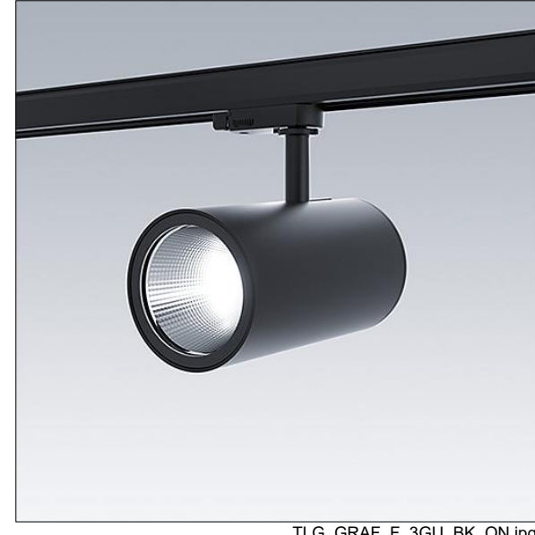
TLG GRAF F 3GU BK ON.jpg