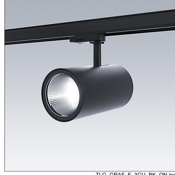
TLG GRAF F 3GU BK ON.jpg