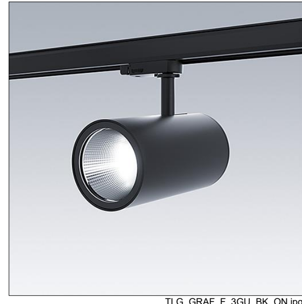
TLG GRAF F 3GU BK ON.jpg