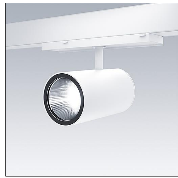
TLG GRAF F CONT WH ON.jpg