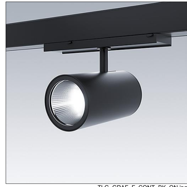
TLG GRAF F CONT BK ON.jpg