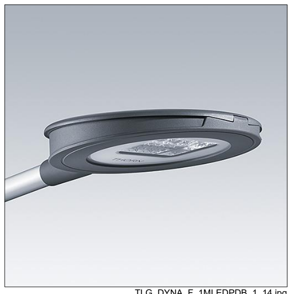
TLG DYNA F 1MLEDPDB 1 14.jpg